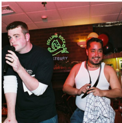
Auction of rugby players (just for the night?), Philadelphia, PA.

cooperative payoff utility Bayesian Normal-form auctions Game Theory Online tragedy of the commons Nash equilibrium class players predator strategies zero-sum probability random math